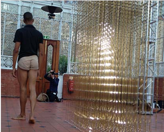
... for an interesting performance...