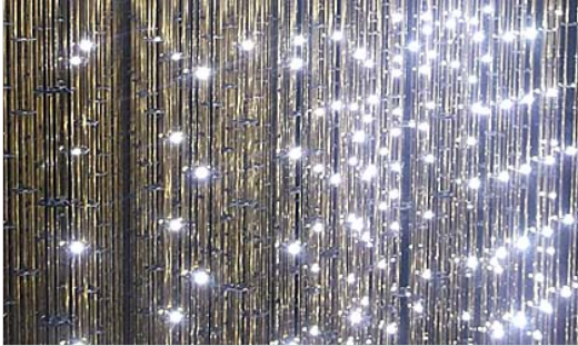
Close up with rAndom International's light installation at the Horniman.

There were poetry readings, happily skewed tours of amazingly idiosyncratic galleries, film screenings and, in the central lower atrium, songs from a three-piece, South American-inspired band with a natty line in multi-coloured shirts.