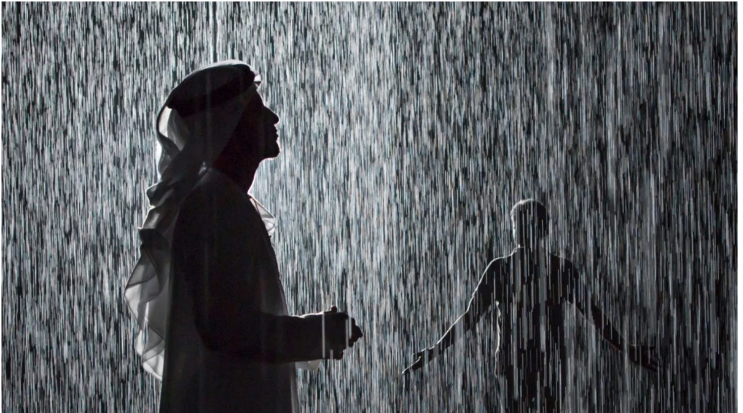
Random International, Rain Room, Sharjah. Courtesy the artists and Sharjah Art Foundation.