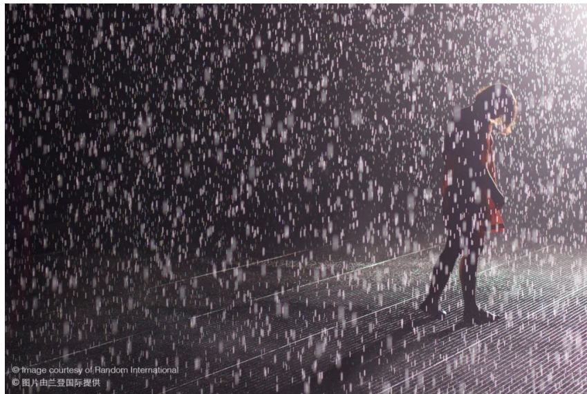
Random International, Rain Room , Shanghai, courtesy of the Yuz Museum.

The Yuz Museum is also showing the newly acquired interactive work Self and Other (2016), which allows viewers to interact with their own illuminated reflections. A new work called Turnstiles (2018) is making its debut in the museum as well. Atypical for Random International, it does not include a digital component; instead, visitors interact with an installation formed by a maze of barrier gates.